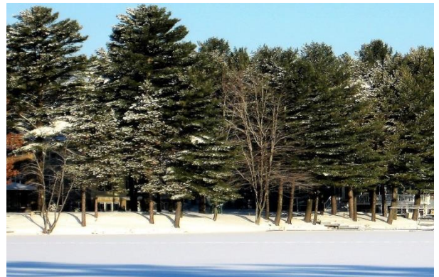
Winter on the Chain