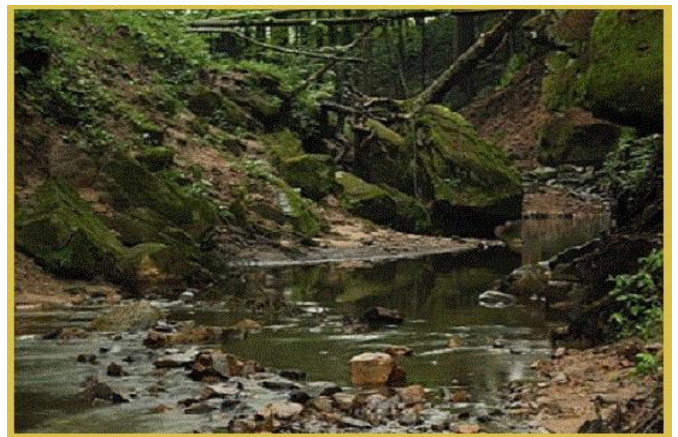
Glen at Durward's Glen